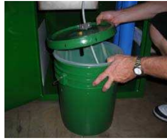
Replace under Cleaner

5) Replace Cleaned Fluid into the Spray Gun Cleaner from previous process. Replace the container or for Heated Systems pour Cleaned Fluid into the container or Wash Basin.