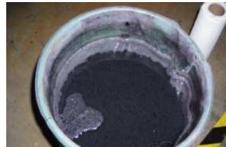
Clean Liquid w/Paint residue settled at the bottom

8) Allow to set for at least 30 Minutes and up to as long as needed to get full absorption of all the paint material. Put the lid in place while material is Focculating.