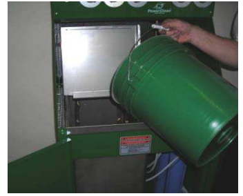
Or Pour Clean liquid back into the system

6) Drop BECCA Clarifier Packets in to Flocculate Dirty Fluid.