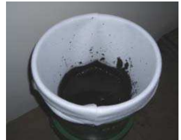
Paint Waste collected by the Filter

12) You are now ready to go through the process again!