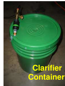
Replace Cover and allow air bubbler to agitate fluid

7) Add Bubbler to container. Adjust flow control to create fluid agitation. Replace Cover and allow air bubbler to agitate fluid