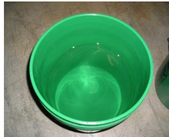
Clean Fluid in the Collection Container

Note!: This Filter can be re-used until the paint solids build up and do not allow the liquid to flow through.