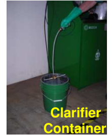
Insert Bubbler into Container