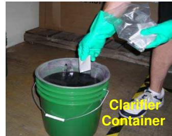
Add Clarifier Packet