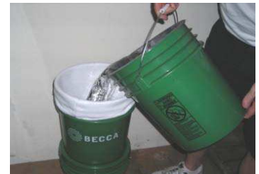
Pour Clarifier Container thru the Filter

9) Once the Dirty Fluid has completed the process you will see Clear Fluid and the paint solids settling at the bottom or floating on top.