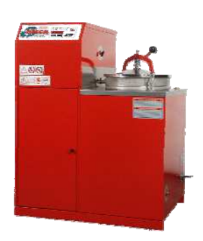
3 & 6 Gallon Recyclers