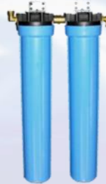
Dual Cartridge System

Note: We see at 40 Micron. So you have a sense on how efficient Filtering to 25 Micron can be.