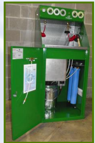
Dual Cartridge System Shown on E800A