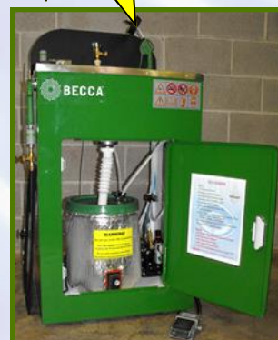
Shown on E100M

Similar to a hot water tank, this system utilizes a heat band and is programmed with a supplied timer to reach the ideal cleaning temperature. This affordable heat option is ideal for units placed outside the paint mix room.